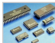
Electronic components marking