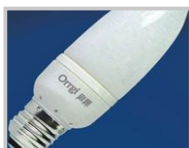
Energy saving lamp holder marking