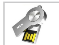
USB laser marking