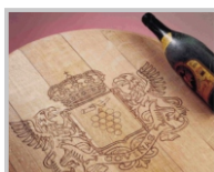
Wood products marking