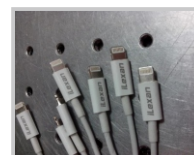
USB data line connector marking