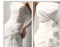
wedding dress cutting