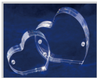
Crystal glass cutting