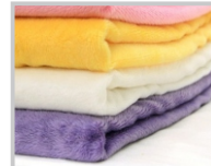
Towel laser cutting