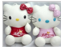
Plush fabric cutting