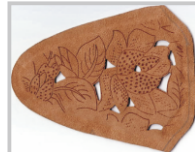
Leather fabrics laser cutting